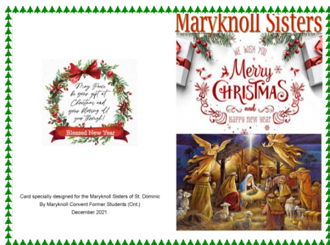
Card specially designed for the Maryknoll Sisters of St. Dominic By Maryknoll Convent Former Students (Ont.) December 2021.

As our Christmas tradition, we will send a Christmas card and gift to the Motherhouse to support our beloved Sisters’ needs. This year, with the generous contribution from some of our members and the funds that we raised in our previous events, we are going to send US$6,000 to the Motherhouse. Thank you very much to all who donate to the Sisters.