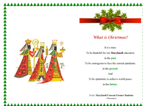
From Maryknoll Convent Former Students (Toronto)